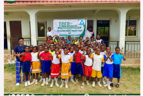
Climate Education session [ESSP] @ Dorcas Palace, Housing/Afao Road Ado-Ekiti. [Primary School]