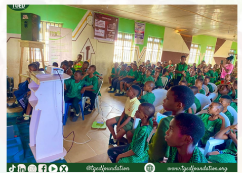
Climate Education session [ESSP] @ St Lawrence International School, Basiri, Ado-Ekiti. [Primary School]