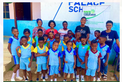
Climate Education session [ESSP] @ Palace School, Adebayo Road, Ado-Ekiti. [Primary School]