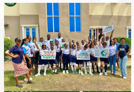
Climate Education session [ESSP] @ Florence Court International School, Ilawe Road, Ado-Ekiti. [Primary School]