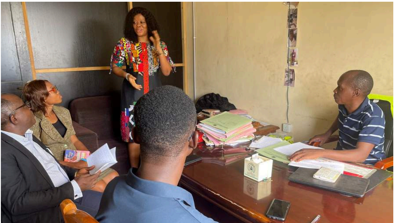
TGED Foundation CEO speaking on the behalf of Ekiti OGP Climate Change and Environment Team