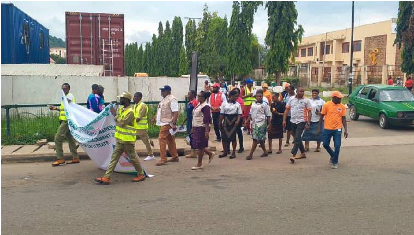
Road walk awareness and community sensitisation on waste management and flood preparedness within Ado Ekiti Metropolis after the workshop program on the 18th of July 2024.