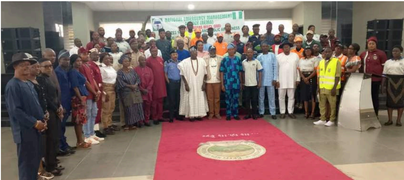
Stakeholders picture at the Waste Management and Flood Preparedness Workshop organised by NEMA.

The workshop highlighted the importance of environmental protection, proper waste management, public health, and flood preparedness strategies. The program was followed by a road sensitization to raise awareness about flood preparedness and proper waste management practices in Ekiti State.