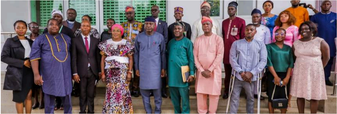
Ekiti State Governor and the Deputy Governor with the inaugurated Ekiti OGP 2024 Steering Committee on the 1st July, 2024.

TGED Foundation is proud to be one of the OGP 2024 Steering Committee. The Committee was inaugurated on the 1st of July 2024 by the Governor of Ekiti State. The OGP Steering Committee comprises of the selected government agencies, civil societies and private sectors in the State.