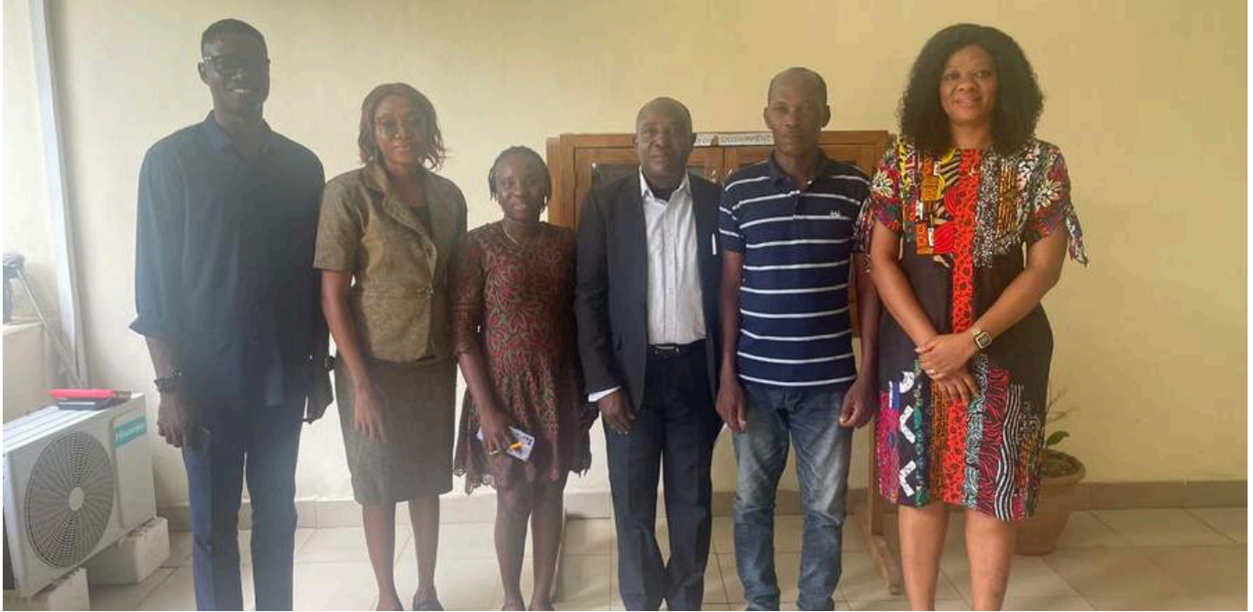
Ekiti OGP Climate Change and Environment Team with Director, Department of Nature Conservation and Climate Change, Ekiti State Ministry of Environment.

TGED Foundation, alongside other members of the OGP Climate Change and Environment thematic group, paid a courtesy visit to the Department of Nature Conservation and Climate Change at the Ministry of Environment. The purpose of the visit was to introduce the OGP Ekiti State Action Plan 2024 and seek collaboration to ensure environmental sustainability in Ekiti State. The group emphasised the importance of joint efforts in achieving the goals outlined in the Action plan and for fostering a sustainable future for the region. This visit marks a significant step towards strengthening partnerships and advancing the OGP's environmental objectives in Ekiti State, Nigeria.